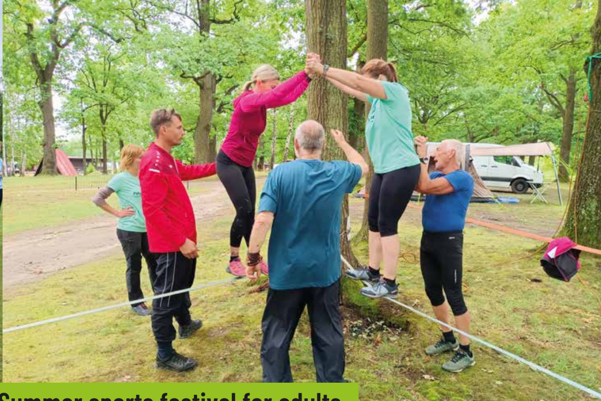
Letní slavnosti dospělých / Summer sports festival for adults