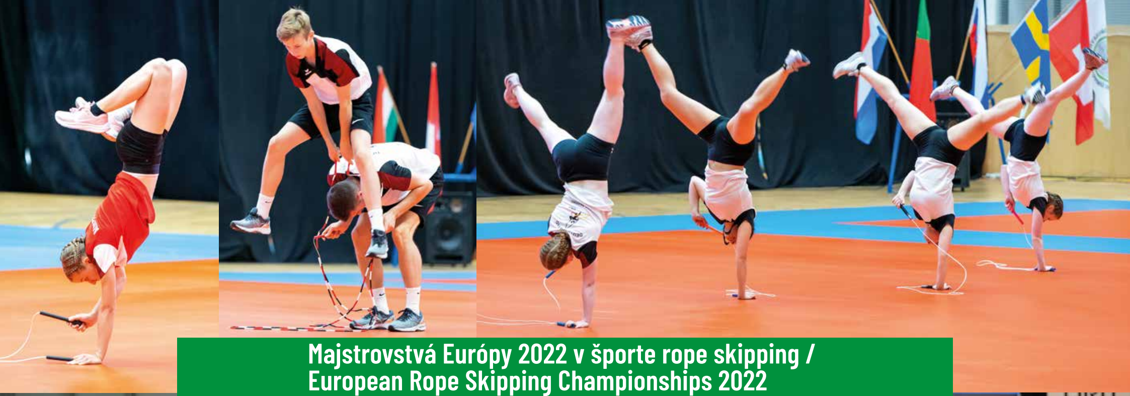
Majstrovstvá Európy 2022 v športe rope skipping / European Rope Skipping Championships 2022