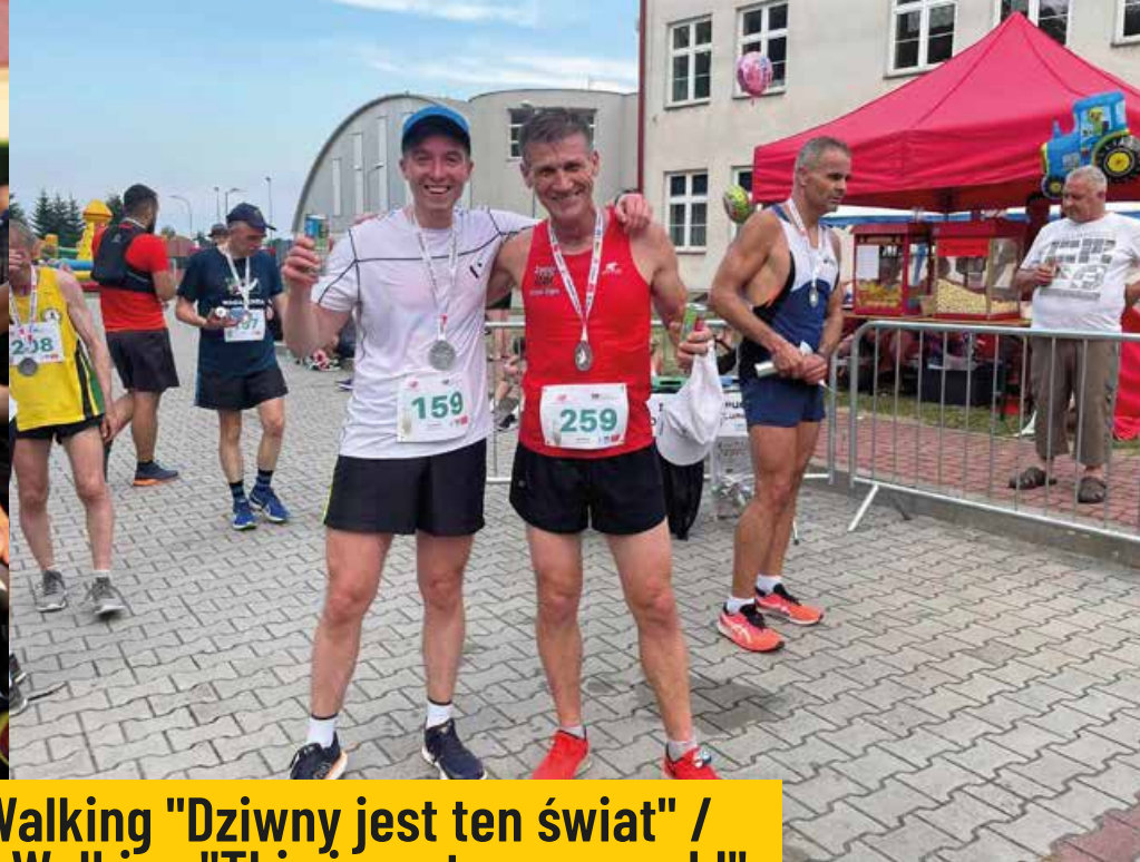
8 Bieg Czterolistnej Koniczynki i Nordic Walking "Dziwny jest ten świat" / 8 Run of the Four-Leaf Clover and Nordic Walking "This is a strange world"