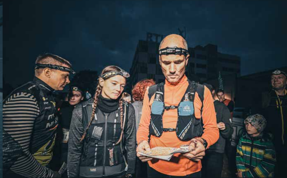
Rīgas Orientēšanās nakts / Riga Orienteering night