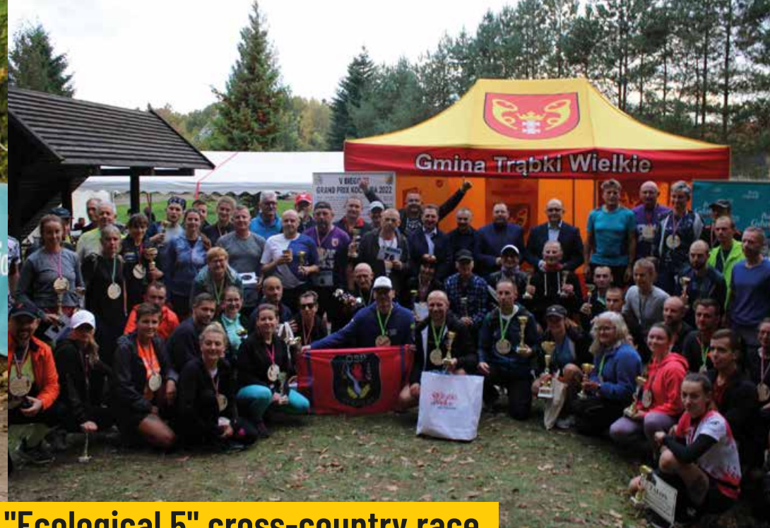
Bieg przełajowy „Ekologiczna 5-tka” / "Ecological 5" cross-country race