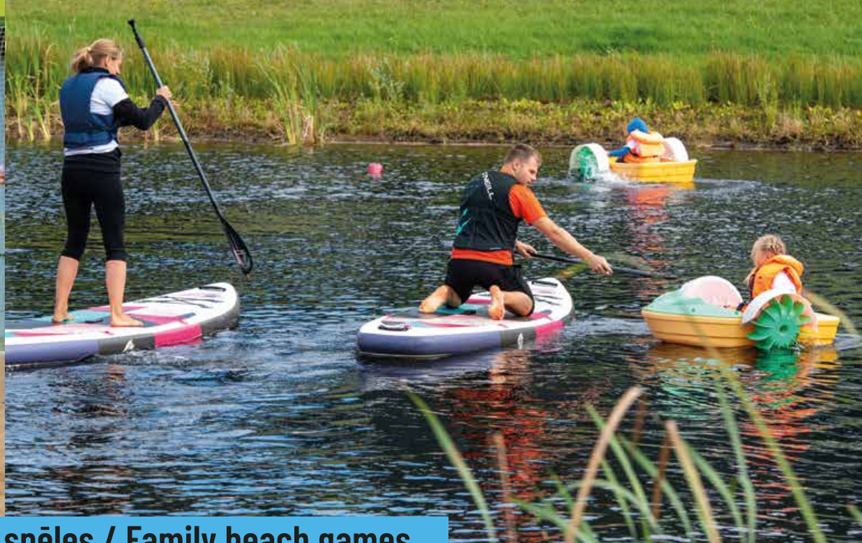
Ģimeņu pludmales spēles / Family beach games